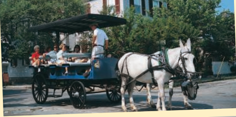
Explore Charleston's elegant Historic District

smaller creek. After a welcoming "handshake" hole, the rest of the course is as tough as the bricks which used to supply Charleston's builders, requiring long carries over marshes or water and pinpoint approach shots.