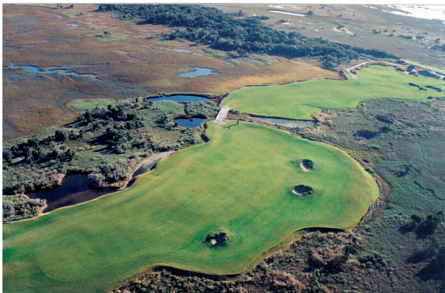
KIAWAH ISLAND GOLF RESORT

If you need convincing that the Ocean Course is tough, here's the evidence