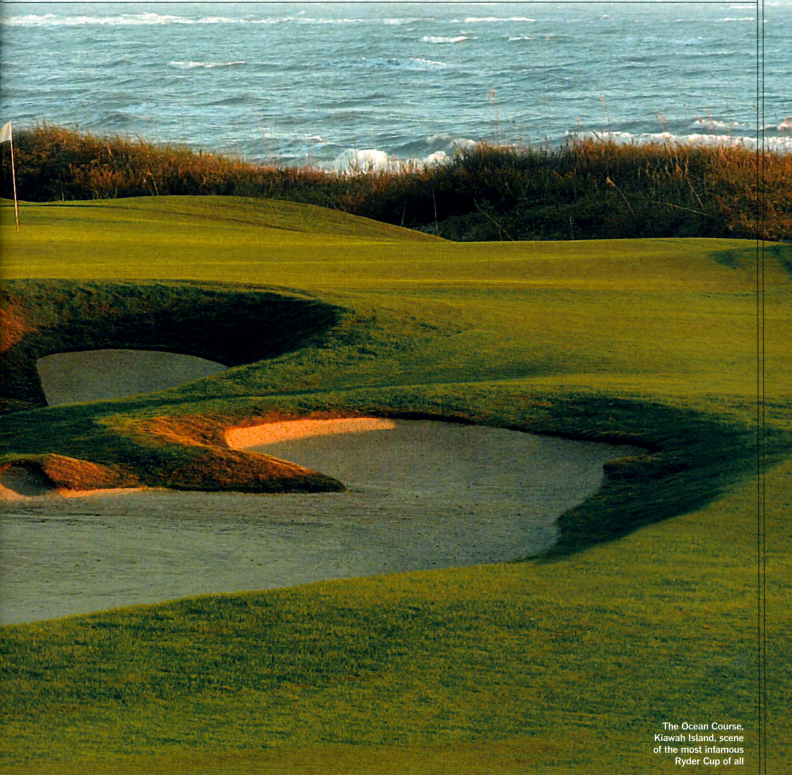
The Ocean Course, Kiawah Island, scene of the most infamous Ryder Cup of all

with a caddy – for the same cost of taking a cart and having a forecaddy – allows golfers to savour its stunning setting and abundant flora and fauna. An Audubon-certified sanctuary, its eco-friendly set-up ensures all water is recycled and does not go onto the marshes while no pesticides or fertilisers are used. Nature thrives in all its forms as a result.