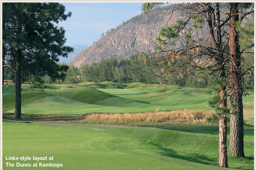
Links-style layout at The Dunes at Kamloops