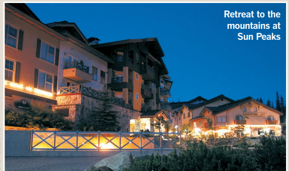
Retreat to the mountains at Sun Peaks