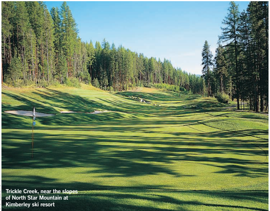
Trickle Creek, near the slopes of North Star Mountain at Kimberley ski resort