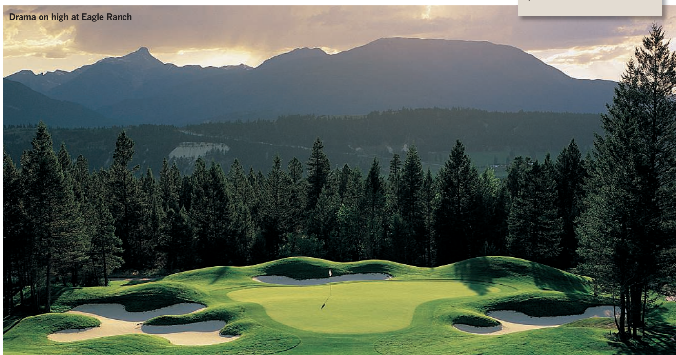
Drama on high at Eagle Ranch

Contact: 00-1-250-342-6941 panoramaresort.com