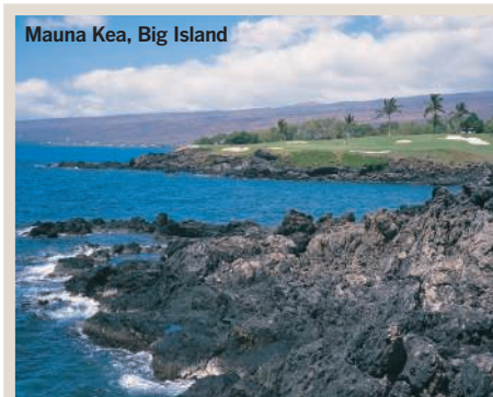
Mauna Kea, Big Island

FRONT COVER PIC: GREYWOLF, BRITISH COLUMBIA