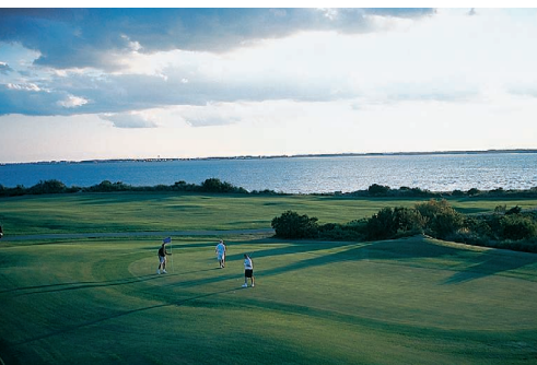
Nags Head is one of the Outer Banks's finest layouts