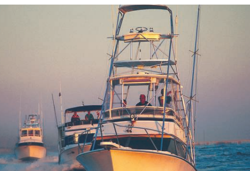
The region is a fishing and boating paradise