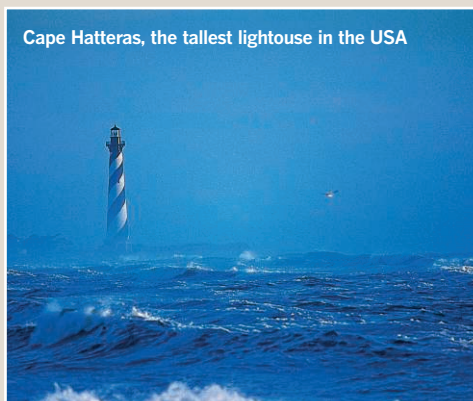
Cape Hatteras, the tallest lighthouse in the USA