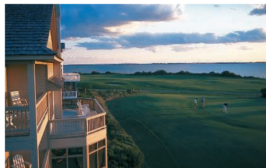
The Outer Banks contain several fine courses

Fred Couples' 27-hole Carolina National course is just south of Wilmington and the nearby Cape Golf & Racquet Club has a double green shared by the 15th and 17th holes.