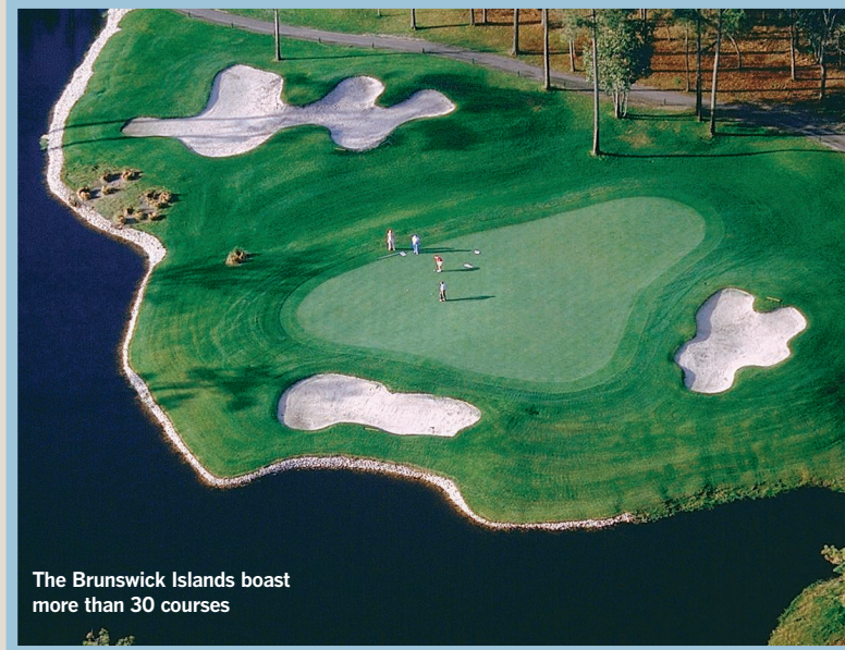
The Brunswick Islands boast more than 30 courses