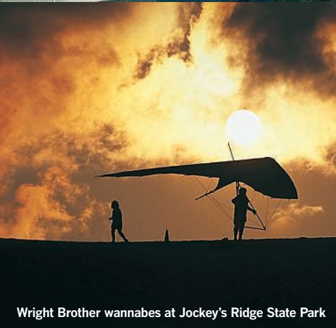
Wright Brother wannabes at Jockey's Ridge State Park