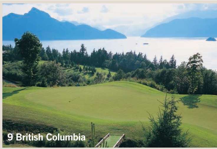
9 British Columbia