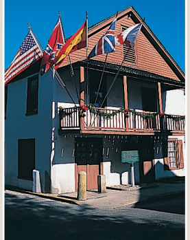
They've all flown over Florida in their time

■ Games, food, weapons and tools tell how life changed from Indian to