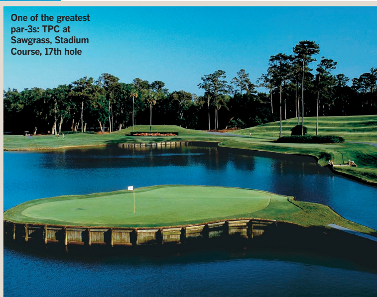
One of the greatest par-3s: TPC at Sawgrass, Stadium Course, 17th hole