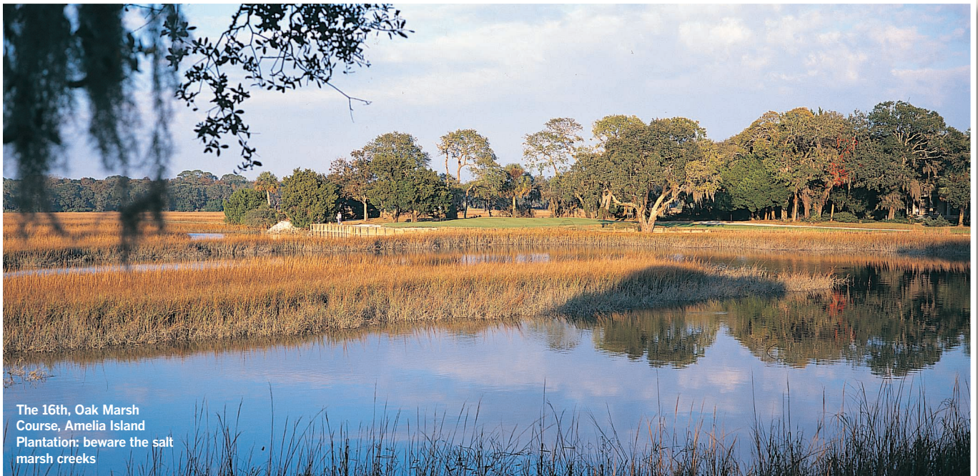
The 16th, Oak Marsh Course, Amelia Island Plantation; beware the salt marsh creeks