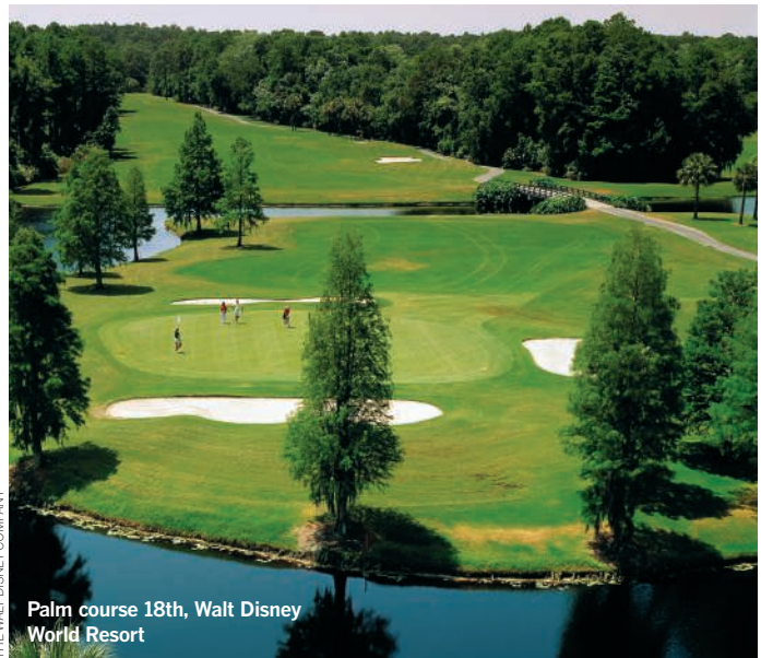
Palm course 18th, Walt Disney World Resort

“The alligator didn't move as she approached for a photo, or as she posed on the tee for the snap. So she went ahead and drove”