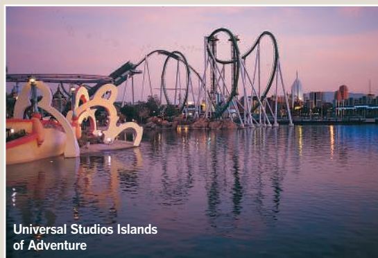
Universal Studios Islands of Adventure

So for your next Orlando holiday, don't just think about Mickey. Go play with Jack, Arnie, Greg and the boys.