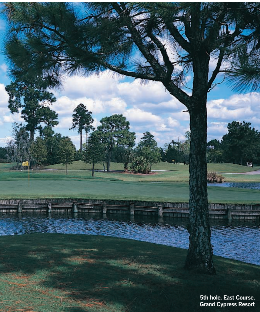
5th hole, East Course, Grand Cypress Resort