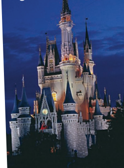
Cinderella Castle, Magic Kingdom

■ Lake Kissimmee State Park , near Lake Wales, is home to deer, alligators, bald eagles and sandhill cranes and includes a 5,000-acre lake where visitors can canoe, camp and hike.