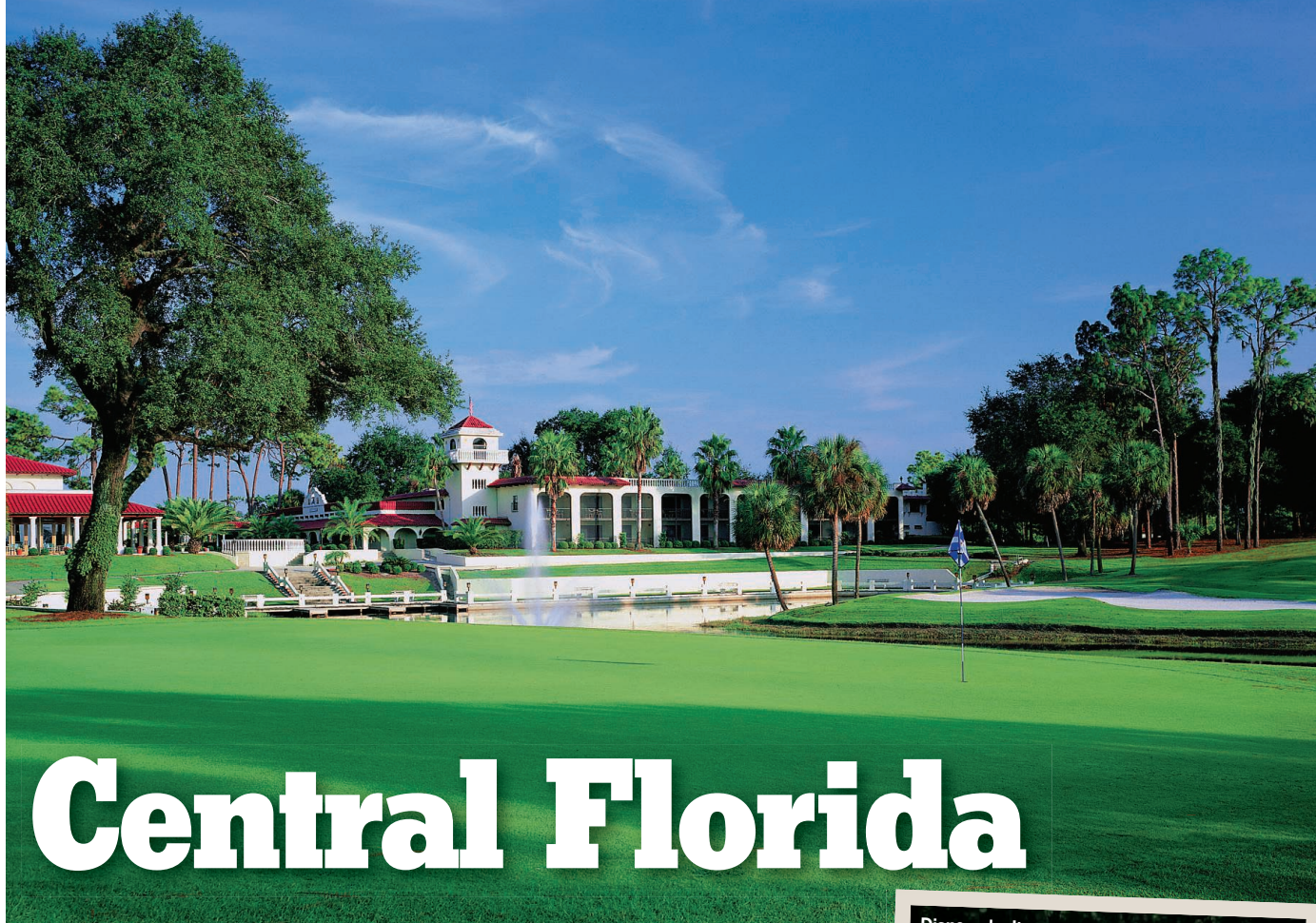
Echoes of old Spain at Mission Inn Golf and Tennis Resort