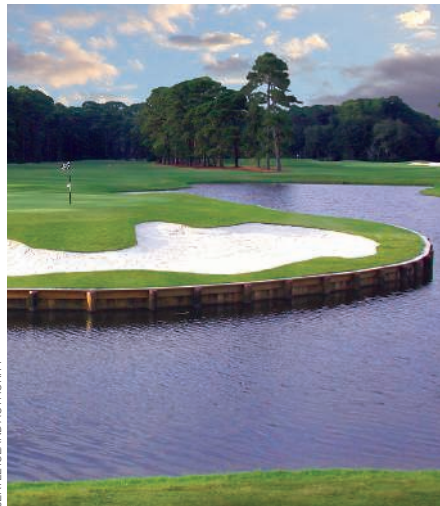
JEKYLL ISLAND AUTHORITY

The Plantation Course evolved from a blend