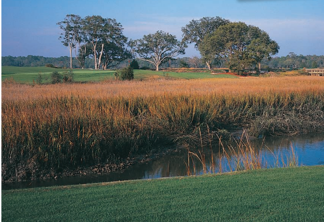
Seaside Course, Sea Island Golf Club, one of America's best resorts