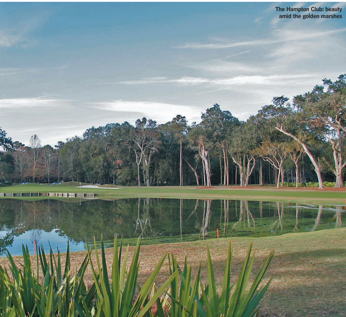
The Hampton Club: beauty amid the golden marshes