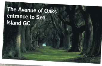
The Avenue of Oaks entrance to Sea Island GC

Sea Palms golf resort, also on St Simons Island, offers 27 holes plus tennis, while mainland town Brunswick has three 18-hole layouts.