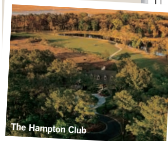
The Hampton Club