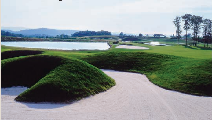
Nemacolin is a golfing resort without rival in the region