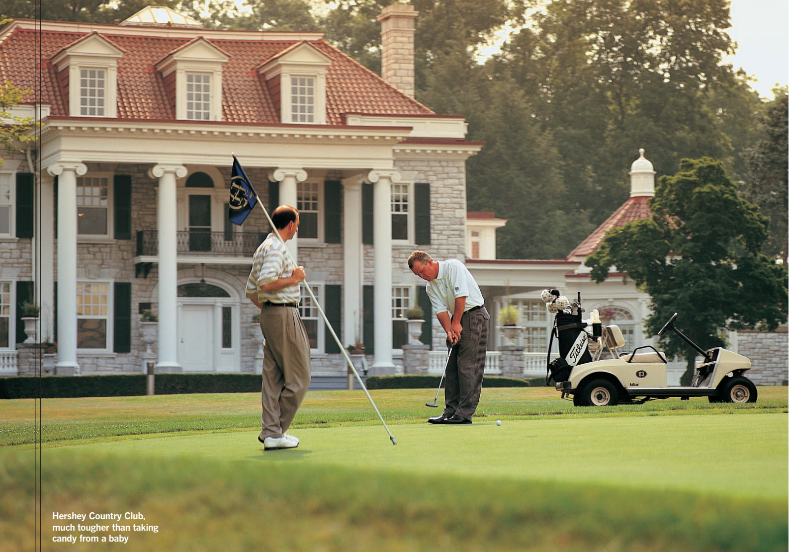
Hershey Country Club, much tougher than taking candy from a baby

T his North Eastern state is the foundation stone of modern American nationhood. The Declaration of Independence was signed and read at Philadelphia in 1776 and the American Civil War turned on the fields of Gettysburg. It's also where the first McDonald's Big Mac was made – dramatic influences on modern American culture – but this is a state whose golfing history is a boast in itself.