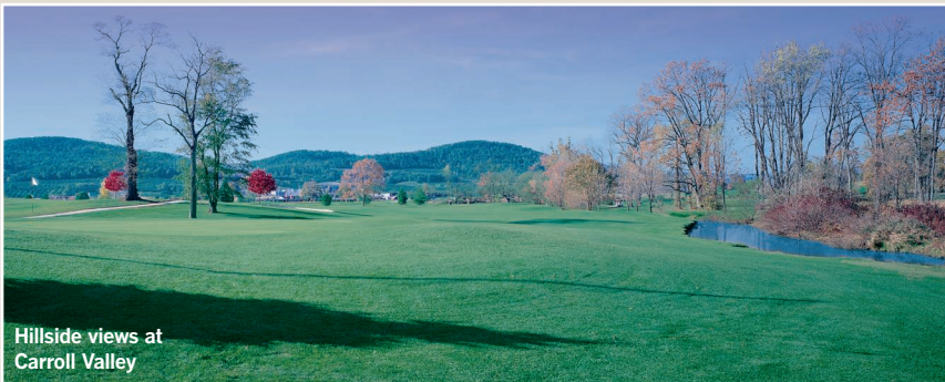
Hillside views at Carroll Valley