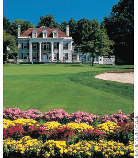
Hershey Country Club