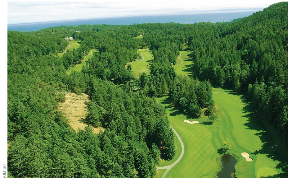
The 17th at Arbutus Ridge, part of a classic British Columbia golf experience